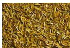
Parboiled Rice Hulls