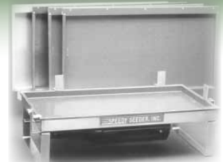
F.O.B. .... Kingston, NC