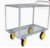
Flat Top Carrier (Shown with Optional Second Deck)