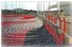
HDX Floor Heating