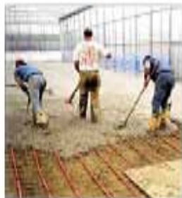
HDX Floor Heating

Projects. If you think about it, it only makes sense to purchase your heating, water management and control systems from one source. That way it's planned and designed to be compatible from the blueprint stage on. It makes the best use of your budget and more importantly your time.