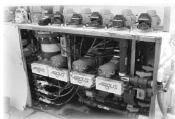
TrueFeed Fertigation System