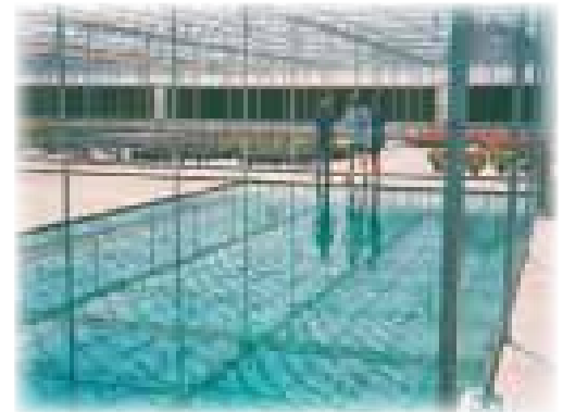
Flood Floor Systems