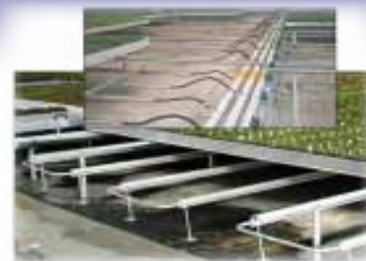
Duofin Finned Heat