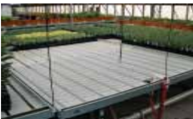
Flood Bench System