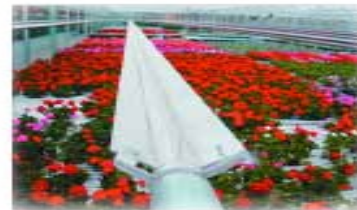
Stealthfin Finned Heat