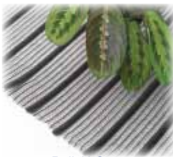
Roll 'N Grow

If installed properly, our Roll 'N Grow Mat systems can be rolled up when not in use! Think about seasonal production areas, outside beds or any growing application where temporary bottom heat might be beneficial... your imagination is the only limiting factor.