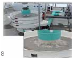
Coarse & Fine Filtration Unit