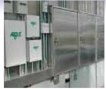
Argus Centralized Environmental Controls

Control Systems are vitally important in successfully operating your greenhouse enterprise. Our staff of experts will guide you through our wide variety of options to make the selection process painless. Whether a "stand-alone" system for each zone or a fully centralized Argus Control System, we'll help you select a system that is seamlessly integrated with your facility.