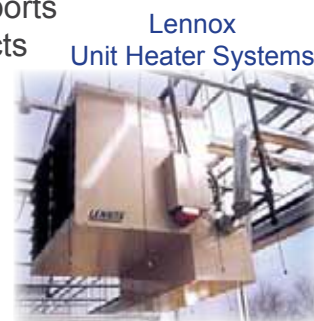
Lennox Unit Heater Systems